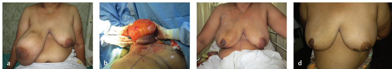
Fig. 2 (a) Case 2 preop. (b) Excision of the giant lipoma. (c) 1 week postop. (d) 3 years postop.