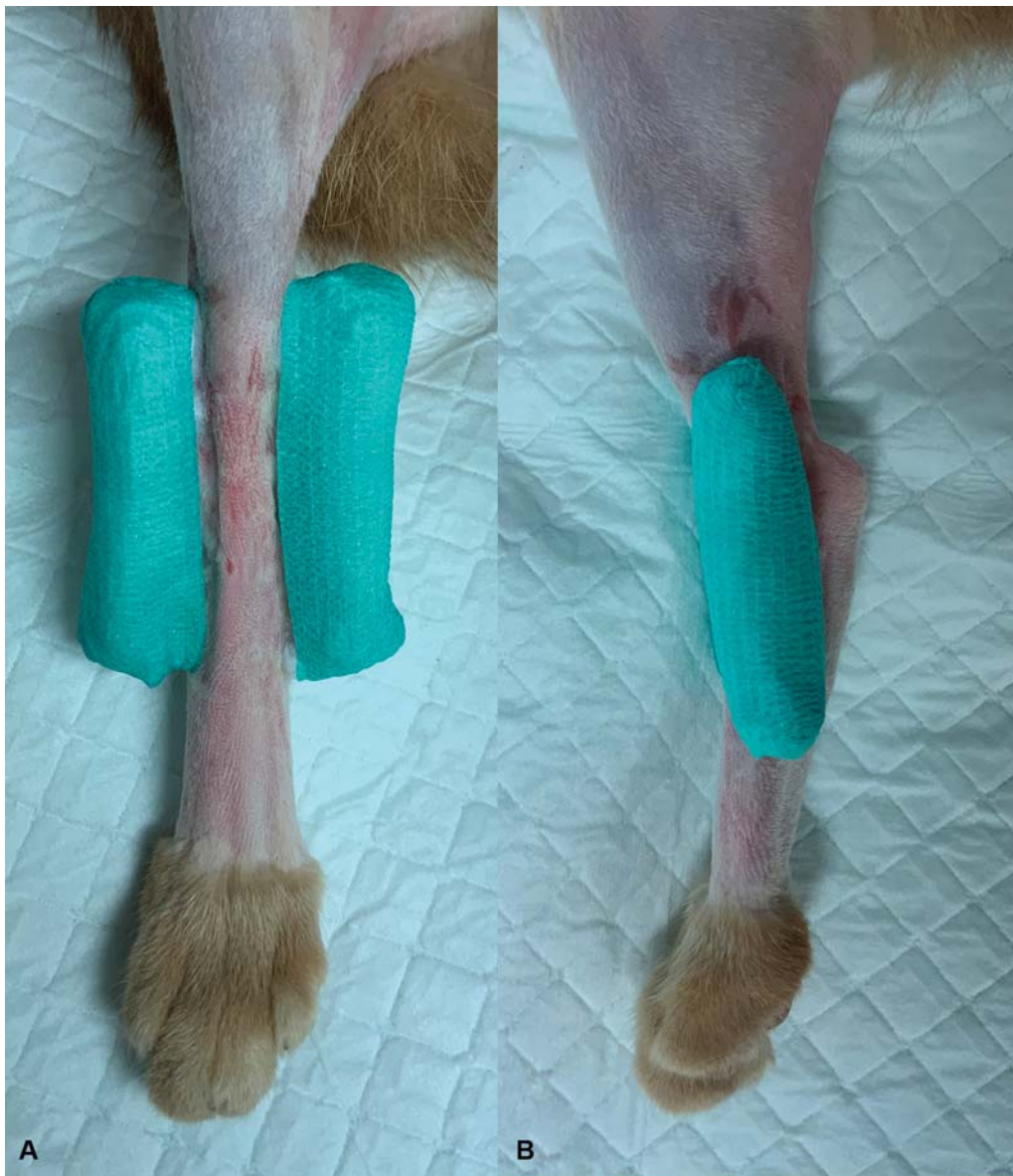
Fig. 2 Photographs (A, B) showing a light-weight bandage applied only around the transarticular external skeletal fixation frame to reduce the risk of self-injury from sharp pins while allowing early weight-bearing.

Clinical and radiographic follow-up was scheduled at 4 to 8 weeks and thereafter as required. All patients were reviewed