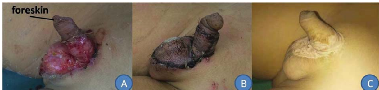
Fig. 2 An 8-year-old boy suffered a high fall-related penile injury and presented with loss of the penile shaft skin and part of the scrotal skin, and retention of the front of the foreskin (A). The split-thickness skin graft survived completely as observed 7 days after surgery (B). The scar was noted to be flat and hypopigmented 3 years after surgery (C).

A Foley catheter was inserted and retained throughout the treatment. We used the dressing for hypospadias surgery as a reference to design the skin graft dressing. On the inner side, a mesh-like lipid hydrogel dressing (UrgoTul, Laboratories URGO, France) was evenly applied to the grafted skin so as to form a moderately tight sheath and to avoid dressing adhesion. An antibiotic ointment (mupirocin) was applied to the second layer, and the outer layer was wrapped with an elastic dressing. The graft was applied tightly to the wound surface, and the absence of dissolution or scabbing was considered to indicate good skin graft survival. The Vancouver scar scale (VSS; Baryza and Baryza, 1995) was used to evaluate the scar quality in all patients. The scale consists of the following variables: vascularity, pliability, height, and pigmentation (→Supplementary Table 1).