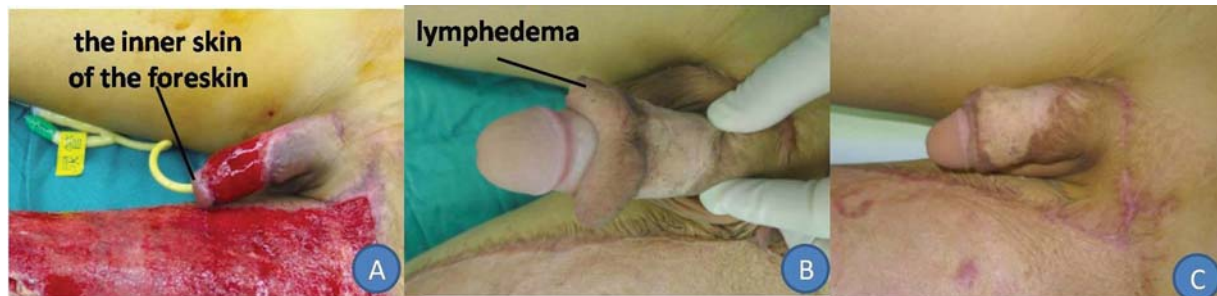
Fig. 4 A 12.5-year-old boy suffered a traffic accident-related penile injury and presented with tearing of most of the penile skin and part of the left thigh skin, and presented with retention of the inner side of the foreskin (A). The split-thickness skin graft survived completely; however, lymphedema of the distal penile skin had developed 1 year after surgery (B). After foreskin plastic surgery, the scar was observed to be flat and hypopigmented (C).

The three thick STSGs survived completely, with no signs of dissolution or scabbing (→Figs. 2, 3, and 4C). The FTSG survived almost completely, with a small area of skin necrosis healing remaining after the dressing was changed (→Fig. 1D). The 12.5-year-old boy gradually developed lymphedema of the distal foreskin (→Fig. 4B), and he received prepuce plastic surgery 6 months after skin grafting (→Fig. 4C). He reported that he could achieve an erection and experienced no pain during urination. All patients were able to urinate easily. The VSS scores of these four patients are presented in →Supplementary Table 1. Scar vascularity and pliability in all four patients were close to those of normal skin. The scars after STSG were hypopigmented and flat, whereas the scar after the FTSG was hyperpigmented, showing slight hyperplasia (< 2 mm). All parents were satisfied with the appearance and function of the penis.