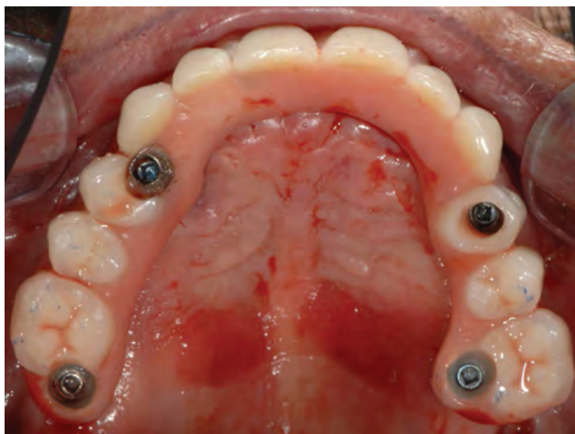
Fig. 2 Intraoral occlusal view at immediate loading (enlargement).

patients received drugs prescription and oral and written recommendations about the correct oral hygiene maintenance and diet. Total 3 to 5 months after implant placement, definitive, abutment-level impressions were taken and screw-retained, CAD/CAM, titanium-composite restorations were delivered (►Figs. 3 and 4). Before screwing, the acetal rings (Seeger system, Rhein'83) were placed between the subequatorial area of the OT Equators (Rhein'83) and the cylindrical "extragrade" framework connections. The prosthesis was screwed twice at 20 Ncm. Occlusion was adjusted and patients were enrolled in a strictly follow-up protocol including occlusal adjustment and hygiene maintenance every 6 months and radiographs every year (►Fig. 5).