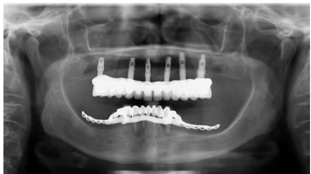
Fig. 5 Radiographic control at the definitive restoration delivery.

technique with Rinn's film holder (Rinn XCP, Dentsply, Elgin, Illinois, United States) taken at implant placement and loading (baseline) and then 1 year after. All the radiographs have been analyzed through a dedicate software (DFW2.8 for Windows, Soredex, Tuuka, Finland) and calibrated for each image using the known distance between two consecutive threads. Difference between baseline and last follow-up was taken as MBL. A dentist, not previously involved in this study, performed every radiographic measurement.