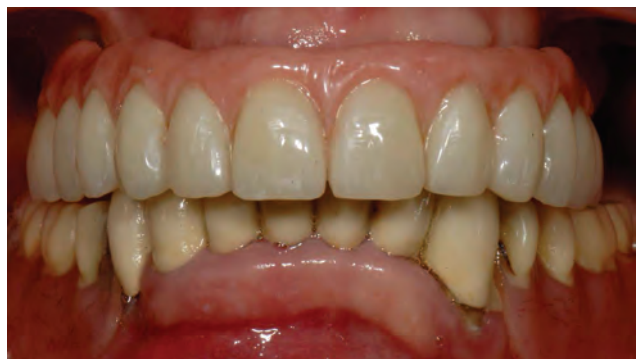
Fig. 4 Intraoral frontal view of the definitive restoration delivery.