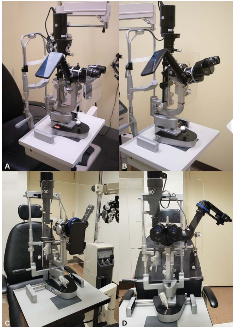
Fig. 2 Clinical set-up of a slit lamp adapter on a slit lamp (Haag Streit BQ-900) with a breath shield and an anteriorly located shield (A) and another example of a posteriorly located breath shield with an inclined eyepiece adaptor that extended the slit lamp and observer scope through the opening in the breath shield (B). A second set-up with an anteriorly located larger breath shield houses a universal slit lamp on the main eyepiece (C) and also on the observer scope (D).

There are several limitations to using teleconferencing software for clinical rotations. Neither Zoom nor FaceTime have manual focusing capabilities, so dynamic adjustment of the slit lamp may be needed to focus the image for the student observer. Another inherent limiting factor of virtual examination is the requirement of smartphones and/or a laptop or desktop computer. Not all students have access to iPhones and thus use of Android operating system or other smartphones will have to be explored. Alternatively, students may use a computer that is located at the medical school or hospital campus to view the exams or a personal encrypted