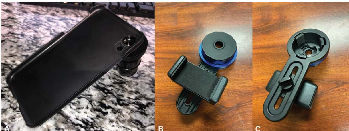
Fig. 1 Two different slit lamp adapters (A, for iPhone 10) and a universal slit lamp adapter demonstrating adjustable smartphone holder (B) and eyepiece adapter (C).

Video of a clinical encounter demonstrating anterior segment examination of a pseudophakic patient and posterior segment examination including view of the optic disc at different magnifications. Online content including video sequences viewable at: https://www.thieme-connect.com/products/ejournals/html/10.1055/s-0040-1716714 .