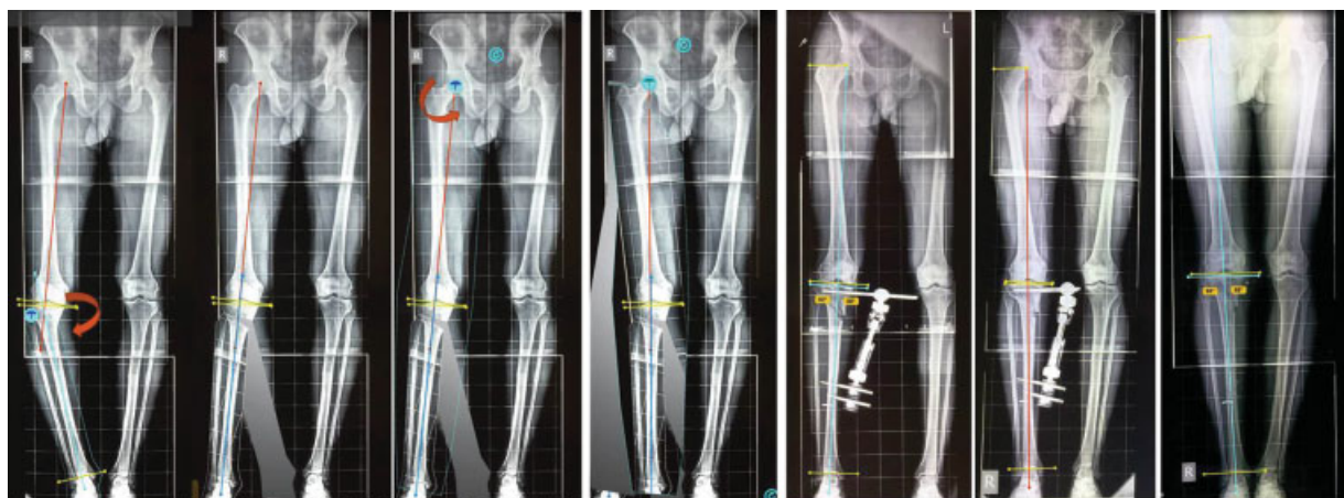
Fig. 2 Simulation of correction using Bone Ninja.

deformity was located at the level of the proximal tibial metaphysis. After marking the line of osteotomy and selecting the cut-out area, we then used the 'thumb-tack' tool to perform a rotational movement of the cut-out area about a specific point (→ Fig. 1 ). The 'thumb-tack' was placed at the level of the tip of the fibular head to create a medial opening wedge osteotomy and, along with it, the mechanical axis of the distal segment was realigned to coincide with the proximal mechanical axis. (→ Fig. 2 ) We mostly performed an over-correction, up to the Fujisawa point. 4 A quantification of the amount of correction (base of the wedge in millimeters) was then done using the 'ruler'. Similarly, a simulation of the corrective osteotomy was performed using the clinical photographs, in the presence of the patient, which enabled both surgeon and patient to see the postoperative radiographic and clinical appearance of the limb (→ Fig. 3 ).