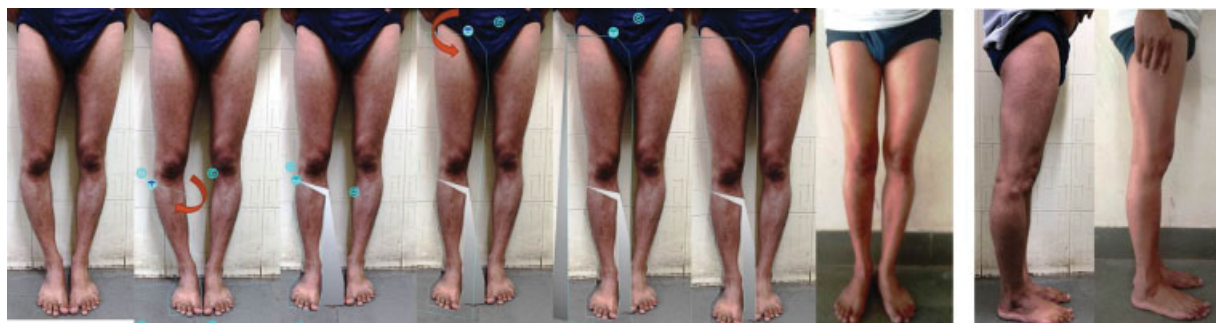
Fig. 4 Simulation of correction on patient's clinical photograph.

The present work was approved by the institutional ethics committee and informed consent was obtained from all individual participants included in the study.