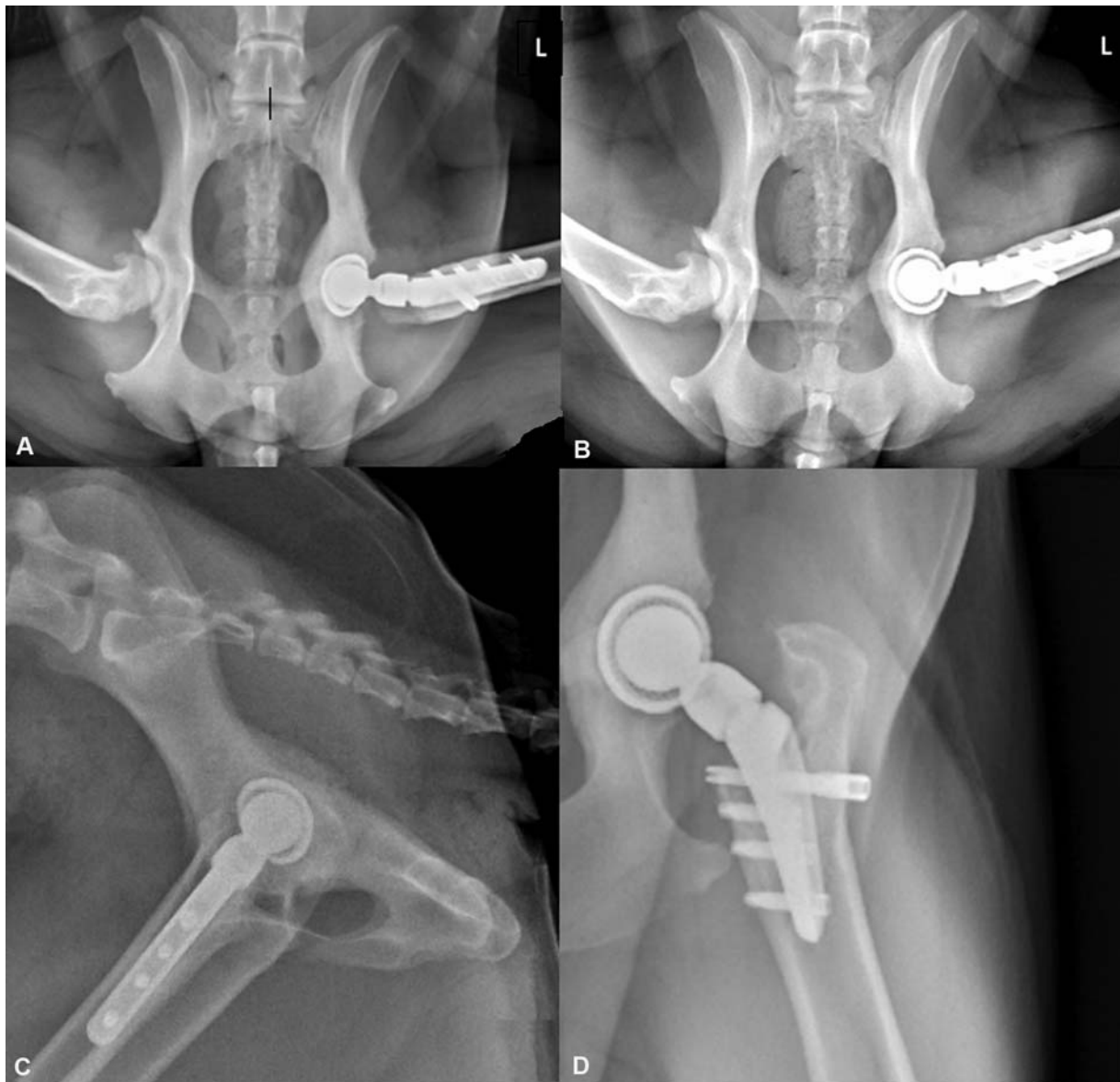
Fig. 1 (A–D) Radiographs ~29 months following initial Z-THR. Parts (A and B) demonstrate gross movement of the acetabular cup is evident through serial projections with the limb in different positions. Panels C and D show no evidence of femoral implant loosening or migration.