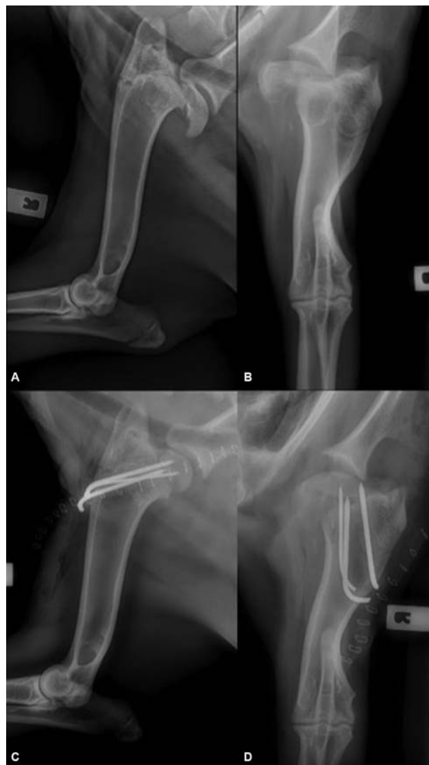
Fig. 1 Preoperative and immediate postoperative radiography (mediolateral projection: (A) and (C); craniocaudal projection: (B) and (D)) of the humerus.

Butorphanol (0.1mg/kg intravenously [IV]) and midazolam (0.1mg/kg IV) were administered as pre-medication. Anaesthesia was induced with a combination of ketamine (5mg/kg IV) and midazolam (0.1mg/kg IV), with anaesthesia maintained with isoflurane. The right thoracic limb was clipped and prepared with chlorhexidine scrub and a 70% alcohol solution in a sterile manner, and the patient positioned in left lateral recumbency. A craniolateral approach to the right shoulder was performed with incision into the deep brachial fascia, caudal retraction of the acromial head of the deltoid muscle, tenotomy of the infraspinatus muscle and incision into the joint capsule. The joint capsule appeared subjectively thickened with evidence of synovitis. The fracture site was identified and a periosteal elevator was used to advance the humeral head fragment cranially. Due to chronicity of the fracture, accurate reduction and alignment were difficult. Two 7/64 (2.77 mm) and one 3/32 (2.38 mm) Kirschner pins were then inserted retrograde from the humeral fracture site proximally to exit the lateral humeral cortex. The pins were then withdrawn until their tips were level with the most proximal aspect of the distal fracture segment. The humeral head was then reduced with a periosteal elevator with concurrent extension