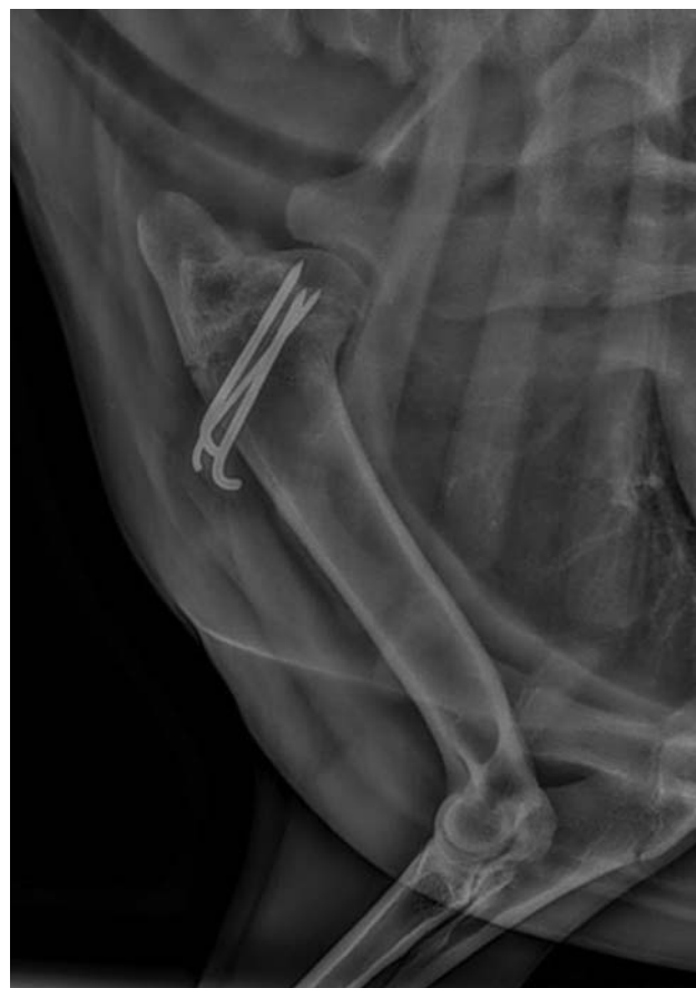
Fig. 2 Radiographs of the humerus obtained 8 weeks postoperatively.

Telephone and video updates were provided at both 3 and 6 months postoperatively by the client (► Video 1 ). No visible lameness was apparent via video update, with the owner reporting that the patient was no longer restricted in activity, with free access to the field. Follow-up of the patient was lost thereafter.