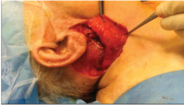
Fig. 1 Retroauricular incision for facelift approach