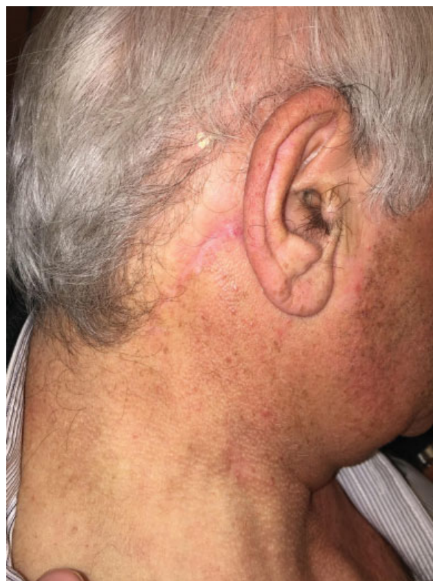
Fig. 3 Aesthetic result after 1 month of follow-up

aesthetic impact if compared with the conventional lateralcervical approach, making scars invisible. In 2013, Tae et al. showed in their study the use of a retroauricular approach with the support of a robotic device compared with conventional neck dissection, showing the overlap of the two techniques in terms of results obtained (on an oncological, functional and aesthetic level). 13 In 2014, Greer Albergotti