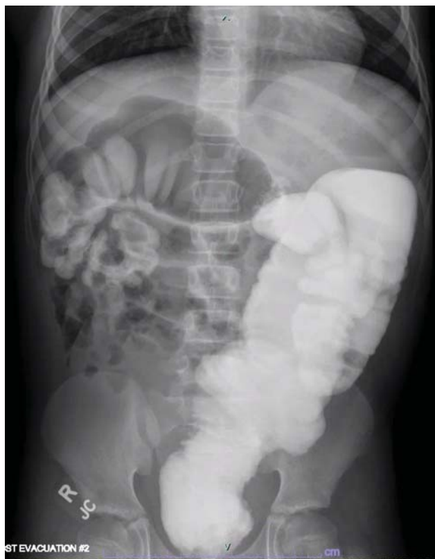
Fig. 1 Contrast enema study.

making, in addition to location of transition zone, extent of colonic dilation, as well the patient's nutritional status. 2,3 In the case presented, the contrast enema demonstrates a low transition zone at the rectosigmoid junction with dilation of the sigmoid colon extending to the descending colon. His history also suggests malnutrition and failure to thrive, not uncommon in HD, but much rarer in functional constipation and colonic motility disorders. We will discuss how each of these factors influence the decision to proceed in this case with a diverting ileostomy with colonic biopsies and future pull-through.