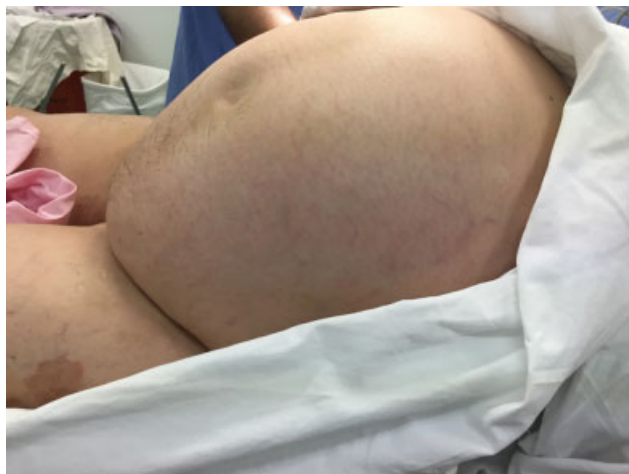
Fig. 1 Giant mass occupying all abdomen.

Surgery can be challenging in these cases. It is quite difficult to consider a minimally invasive approach in a large abdomen, as most of the incisions were xiphopubic. Within the selected