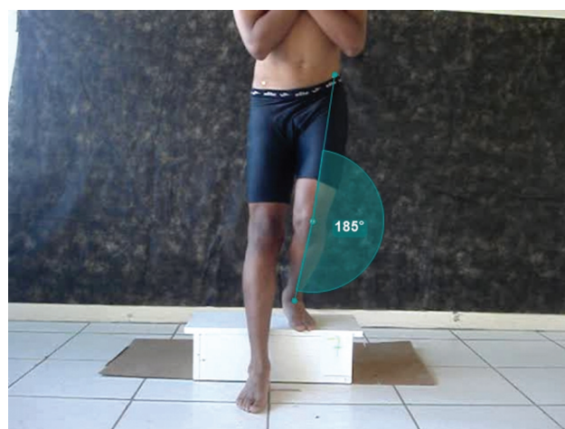
Fig. 2 Evaluation of the frontal plane projection angle (FPPA) of the knee using the step-down test in young soccer players (Kinovea software, version 0.8.24).