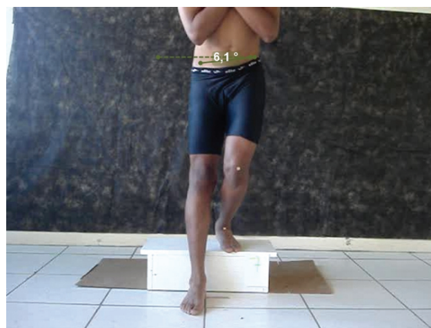
Fig. 1 Evaluation of the pelvic drop using the step-down test in young soccer players (Kinovea software, version 0.8.24).

The angles were analyzed using the Kinovea software, and the values are presented as means and standard deviations. The Shapiro-Wilk test was performed to verify data distribution. The Student t -test for independent samples was used for the comparative analysis of the mean pelvic drop and mean FPPA in athletes from both genders; the level of significance was set at 5%. The Pearson correlation was used to analyze the association between the pelvic drop and the FPPA. The r -value was interpreted as follows: r = 0 to 0.19, no association; 0.2 to 0.39, low association; 0.4 to 0.69, moderate association; 0.7 to 0.89, high association; and 0.9 to 1.0, strong association. All statistical analyses were performed using the STATA (StataCorp, College Station, TX, US) software, version 12.2.