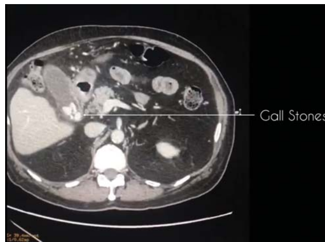
Fig. 1 CT image showing gall stones and surround peri gall bladder fat stranding. CT, computed tomography.

The patients are operated under general anesthesia using the standard four-port technique. A few technical modifications are advocated in cases of severe inflammation. A distended