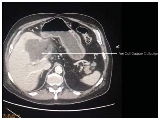
Fig. 2 CT image showing collection in the gall bladder fossa suggestive of a perforated gall bladder. CT, computed tomography.

GB is decompressed with an 18-Gauge spinal needle and GB bile is sent for culture and antibiotic sensitivity. Dissection of the posterior leaf of peritoneum covering the neck of the GB is commenced above the Rouviere's sulcus and effective retraction of the GB is ensured to dissect the Calot's triangle and achieve the critical view of safety (CVS).