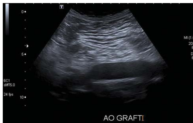
Fig. 3 B-mode image of the proximal anastomosis.

His postoperative course was uneventful and he was discharged from hospital on postoperative day 8. The patient continues to do well 3 years later. The last follow-up ultrasound imaging at 3 years from surgery revealed normal findings (► Figs. 3 and 4 ).