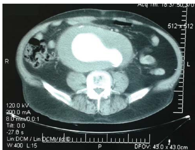
Fig. 1 Contrast-enhanced computed tomography demonstrates a giant aortoiliac aneurysm at the level of the aortic bifurcation with extensive thrombus.