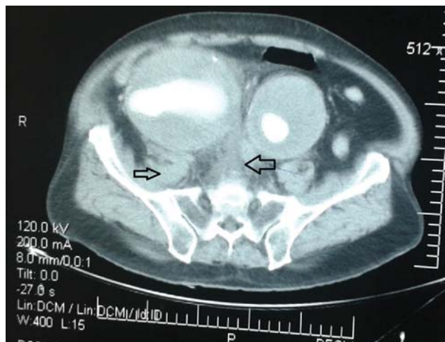
Fig. 2 Appearance of giant iliac aneurysms with extensive thrombus and signs of rupture in the medial wall of the right iliac artery. Significant retroperitoneal pelvic hematoma is shown (arrows).

Y-shaped Dacron graft 18 mm × 9 mm was used. Proximal anastomosis at the infrarenal aorta was performed just below the renal arteries. Distal anastomoses were performed in an end-to-end fashion with the external iliac arteries. The right internal iliac artery was oversewn from within at the ostium, while the left was revascularized via a jump graft from the iliac limb of the bifurcated graft. The jump graft was anastomosed in an end-to-end fashion to the ostium of the left internal iliac artery.