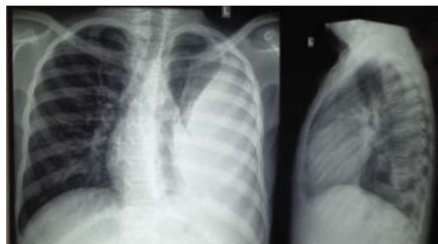
Fig. 1 Left-sided tuberculous pleural effusion of case 1.

Xpert MTB/RIF of pleural fluid detected rifampicin sensitive MTB. Pleural fluid glucose, 6 mmol/L; lactate dehydrogenase (LDH), 553.2 IU/L; and protein, 317 mg/dL. Urine sodium was <50 mmol/L, serum osmolality was 287 mOsm/kg, and urine osmolality was 243 mOsm/kg. Abdominal ultrasound scan