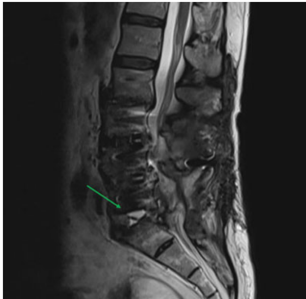
Fig. 3 Sagittal T2-weighted magnetic resonance image showing hyper-signal at the L5-S1 disc space referring to the local fluid collection.

(lumbosacral spine x-rays) showed signs of lumbosacral arthrodesis consolidation (→ Figure 4 ).