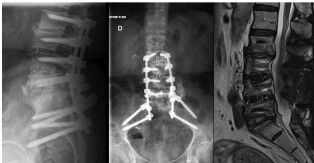
Fig. 4 Lateral (left) and front (center) spine radiographs showing signs of arthrodesis (L2-S1 fusion) and sagittal T2-weighted magnetic resonance image (right) showing signs of infection resolution.