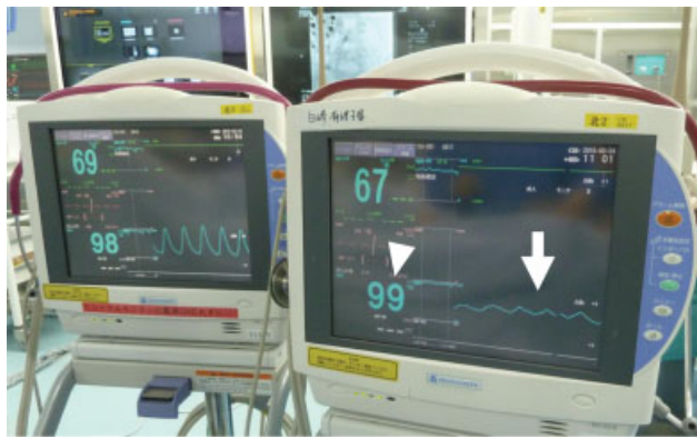
Fig. 2 Pulse oximeter waveform. Pulse oximetry waveforms after a temporary blockage of the flow of one common iliac artery. The display on the left shows a normal pulse oximetry waveform and right shows a low amplitude waveform (arrow), indicating poor leg perfusion. Note that SpO 2 measurements are kept at 99% (arrowhead). (Reproduced with permission from Eiji Kondoh, Ikuo Konishi. Perinatal Medicine (Tokyo). (Japanese). Tokyo Igakusha. 2015;45:1131–1135).