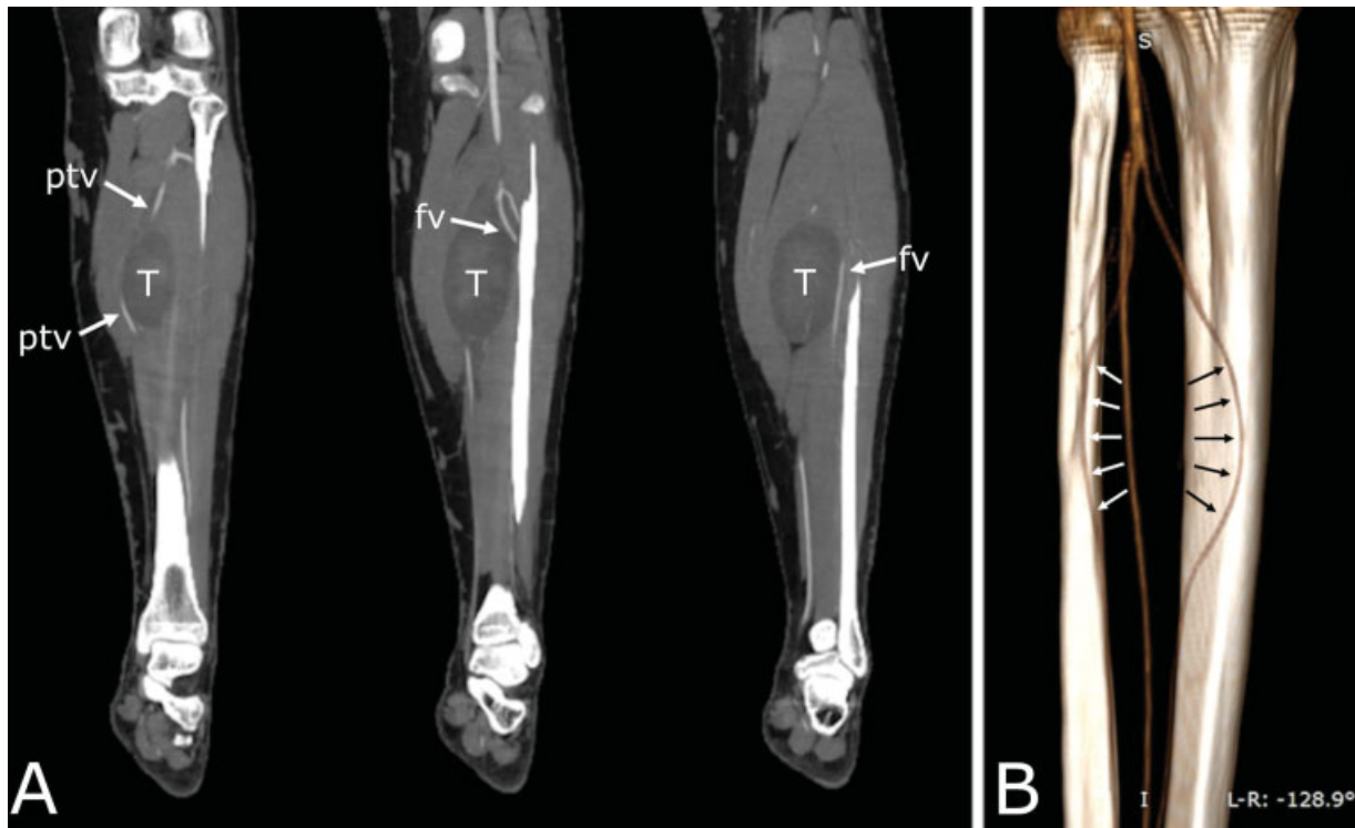
Fig. 1 (A) Three coronal slices of a computed tomography angiogram (angio-CT) showing the compression of the posterior tibial veins by the tumor (T) arising from the tibial nerve. Note the deviation of the course of one of the posterior tibial veins (ptv), compressed against the muscles of the posterior compartment of the leg. One of the fibular veins (fv) appears to be compressed against the fibula. (B) 3D reconstruction of an angio-CT from a posterior-medial point of view showing the mass effect of the tumor onto the posterior tibial veins. The white arrows show one of the deviated fibular veins. The black arrows show one of the deviated posterior tibial veins.