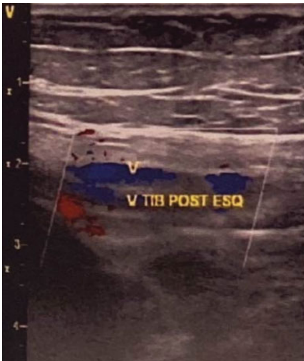
Fig. 2 Doppler ultrasonography of the left posterior tibial veins, performed two months after hospitalization for the treatment of deep vein thrombosis. There is partial recanalization, yet the thrombus is still present. Abbreviation: V TIB POST ESQ, left posterior tibial veins.

plantar hypesthesia. The mass was not palpable, yet the left leg was edematous. There was also a positive Tinel sign over the course of the left tibial nerve.