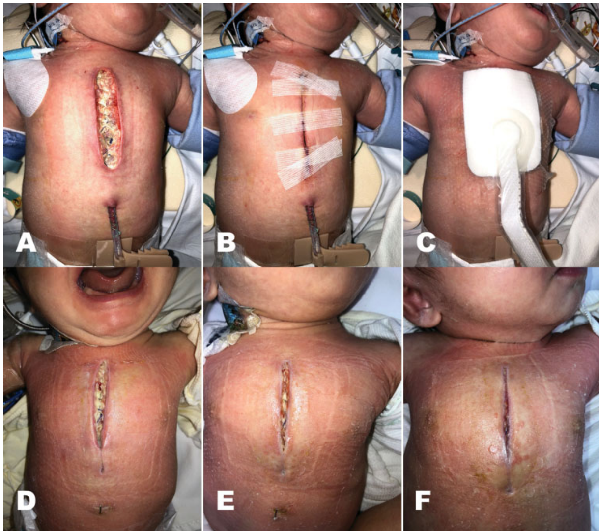
Fig. 1 Noninvasive and serial wound approximation of pediatric sternotomy wound dehiscence. (A) Minimal bed side debridement was performed for easy approximation. (B) Wound was approximated with adhesive skin tapes. (C) Single-use negative pressure device was applied on the approximated wound. (D–F) Seven, 14, and 21 days after first single-use negative pressure device application (patient no. 6).

Since 1997, when Argenta and Morykwas 4 announced the usefulness of vacuum-assisted closure (VAC) in wound care, this innovative dressing has been widely used in a variety of acute and chronic wounds, including poststernotomy wounds. Agarwal et al, 5 one of the earliest groups that introduced VAC as the first-line therapy for sternal wound management, applied it to SWD as well as SSWI and DSWI to emphasize the efficacy of VAC as both, sole and adjunctive therapies, in complex sternal wound management. Bakaeen et al 6 demonstrated the safety and effectiveness of negative pressure wound therapy (NPWT) in noninfected open chest management with potential to improve outcomes. Phoon and Hwang 2 emphasized that NPWT plays an important role in the management of DSWI and mediastinitis.