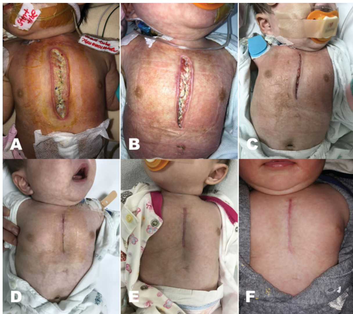
Fig. 3 Noninvasive and serial wound approximation of pediatric sternotomy wound dehiscence. Representative case of patient no. 5. (A) Initial wound presentation on postoperative day 11, first day of wound approximation and negative pressure device application; (B) 11 days after treatment; (C) 20 days after treatment; (D) 41 days after treatment, the day of hospital discharge; (E) 2 months after treatment, at the outpatient clinic; and (F) 5 months follow-up.

The inner silicone wound contact layer does not lead to ingrowth of the granulation tissue into the dressing, which alleviates the pain and discomfort during dressing changes, and therefore is another specific benefit in the pediatric population. Its connecting tube is integrated on the top surface of the dressing without any particular pressure area so that no specific effort is required for proper tube placement.