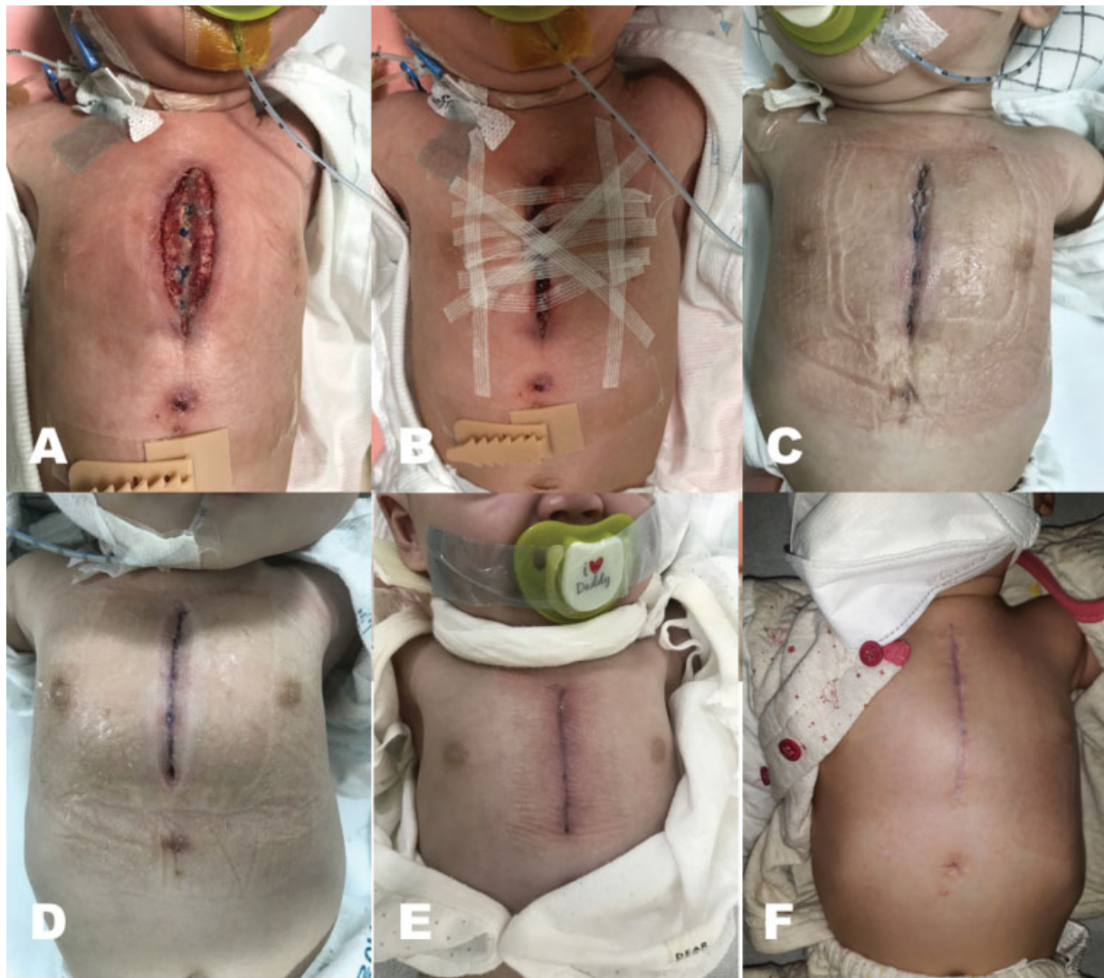
Fig. 4 Noninvasive and serial wound approximation of pediatric sternotomy wound dehiscence. Representative case of patient no. 4. (A) This patient was treated with conventional vacuum-assisted closure for 10 days before referral to the plastic surgeon. Wound margins were widely separated, although healthy granulation tissue was formed in the wound bed. (B) Wound margins were elevated and everted from the wound bed under mild sedation and local anesthesia, and then serial approximation was started; (C) 14 days after treatment; (D) 20 days after treatment, the last day of negative pressure wound therapy; (E) 30 days after treatment; (F) 5 months follow-up.

margins from the wound bed using a Freer elevator, and then resumed the serial approximation. DeFazio et al 17 also witnessed this problem and combined bridging retention sutures with NPWT to achieve progressive tissue retraction over time and guide dermal approximation while minimizing the volume of sponge required to fill the three-dimensional cavity. Although the technical details are different, our concept is similar in that we also simultaneously pursue wound decontamination, reduction of dead space, and marginal apposition. Judicious use of the early serial approximation technique can yield superior aesthetic results than secondary intention healing. In particular, it excludes the necessity of surgical procedures for definitive closure in many SWD, SSWIs, and selected “superficial” DSWIs in pediatric SWC patients. It would be the best to start at the early resilient wound period for maximum benefit, when adhesion and wound contracture have not yet been estab-