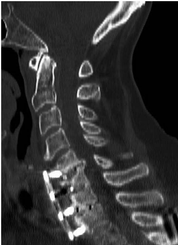
Fig. 1 Computed tomography of the cervical spine showing anterior cervical discectomy and fusion with plating at C5 to T1, pseudarthrosis (failed fusion), subsidence (interbody cage migration), and loosening of hardware (screws and plate).

interface for fusion, and the literature suggests evidence of improved fusion rates and patient outcomes when this approach is taken. 5,12-14 In some advanced cases of failed fusion with segmental instability and associated kyphotic deformity, a combined anterior-posterior approach may be suitable to achieve a durable arthrodesis.