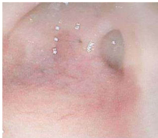
Fig. 3 Esophagogastroduodenoscopy showing a pyloric web with a tiny hole and inflammation in the stomach.

Therefore, the presenting symptoms and time of diagnosis can vary between cases according to the degree of obstruction and associated comorbidities. Prenatal diagnosis may be possible in cases with a dilated stomach, absence of a double bubble sign, and presence of polyhydramnios, as reported in 50% of cases in the last trimester. However, the findings were