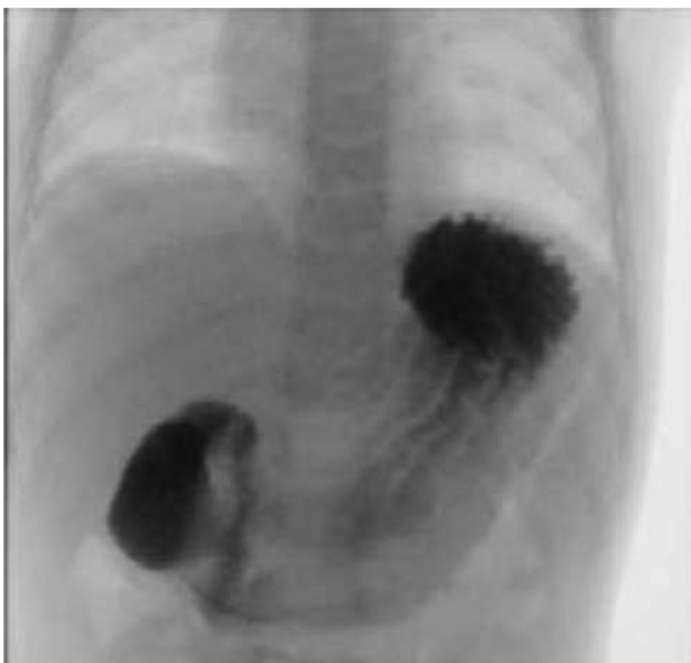
Fig. 2 Upper gastrointestinal contrast showing delayed passage of contrast from the stomach into the duodenum.

After a week adjustment of the malnourished state through parental nutrition through a peripherally inserted central catheter line, the patient was taken for operative exploration through a right upper quadrant transverse incision. The pylorus was delivered and looked thickened, and a full-thickness longitudinal incision on the anterior surface of the pylorus was made and a pyloric web was detected. A partial excision of the web was performed leaving the posterior wall of the pylorus intact followed by a Heineke-Mikulicz pyloroplasty. The patient was started on oral feeds after 48 hours with low volumes, which were gradually increased to achieve full oral feeding on postoperative day 5.