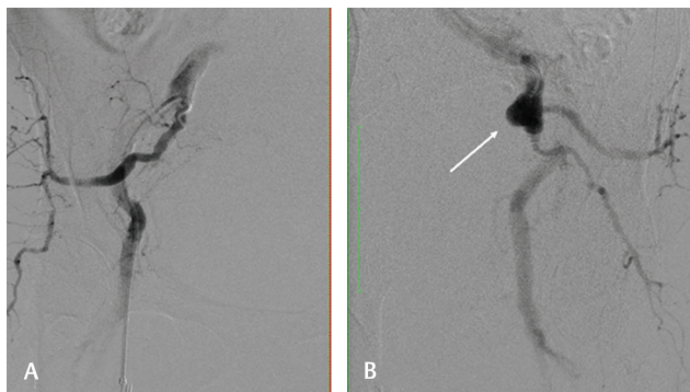
Fig. 1 (A) Right anterior oblique digital subtraction angiography (DSA) of the right IIA demonstrating occlusion of the anterior division and no apparent prostatic artery. (B) Left anterior oblique DSA of the left IIA demonstrating a 2.5-cm aneurysm (arrow) and no apparent prostatic artery.

The case in this study describes embolization of the prostate from an artery with a unique origin arising from the PFA. This scenario underscores the potential for prostatic blood supply to collateralize through various pathways in the setting of atherosclerotic occlusion of the native prostatic artery. This phenomenon adds to the technical difficulty and anatomical variability of an already challenging procedure.