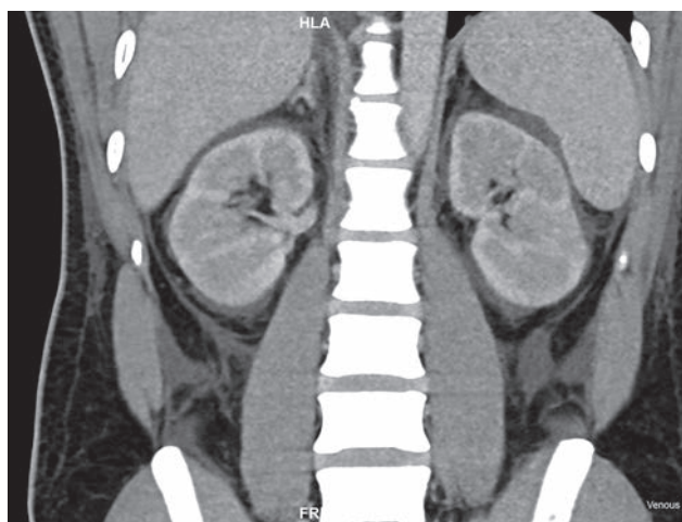
Fig. 2 Coronal postcontrast abdomen image in venous phase shows areas of poor enhancement in both kidneys.

Urinoma in the perinephric location is most often due to rupture of the pelvicalyceal system/ureter, secondary to distal obstruction or a direct injury. The collection of urine secondary to renal parenchymal disease in the perirenal region is very rarely reported. Among the parenchymal disease, most of the reported cases were secondary to nephrotic syndrome. To date, only a few cases of spontaneous perinephric urinoma secondary to drug-induced acute interstitial nephritis were reported in the literature. 1 In our case of perinephric urinoma, AIN was secondary to Diclofenac injection.