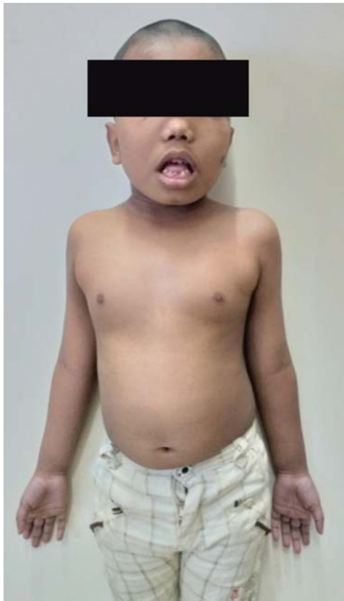
Fig. 1 Frontal photograph of the patient shows facial dysmorphism with a flat nasal bridge, prognathic mandible, and protruding tongue.

of the skull (► Fig. 2 ) showed generalized thickening of the skull vault, maxilla, and mandible involving both inner and outer tables with partial obliteration of diploic spaces. The skull had a patchy copper-beaten appearance. The maxillary sinus was not visualized. The rest of the skeletal survey was normal.