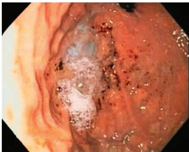
Fig. 2 Endoscopic insufflation–induced gastric barotrauma grade 1 presenting as appearance of petechial spots in the fundus with no discernable mucosal breaks.