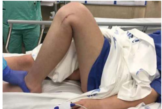
Fig. 5 Six months knee range of motion.

articular surface and maintain alignment, length, and rotation. 3-6 To prevent stiffness and ease recovery, early range of motion is paramount, which in turn depends on stable fixation. 3,4