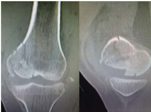
Fig. 3 Computed tomography scan—coronal and sagittal cuts.