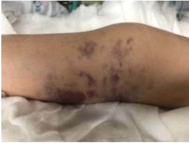
Fig. 1 Effusion and ecchymosis of the injured knee.