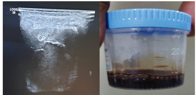
Fig. 3 Showing (A) ultrasound image and (B) image of the fluid aspirated using needle.