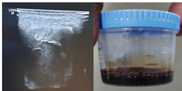
Fig. 3 Showing (A) ultrasound image and (B) image of the fluid aspirated using needle.