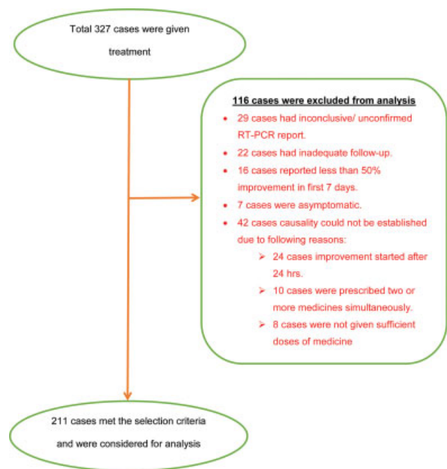
Fig. 1 Flowchart of the study.