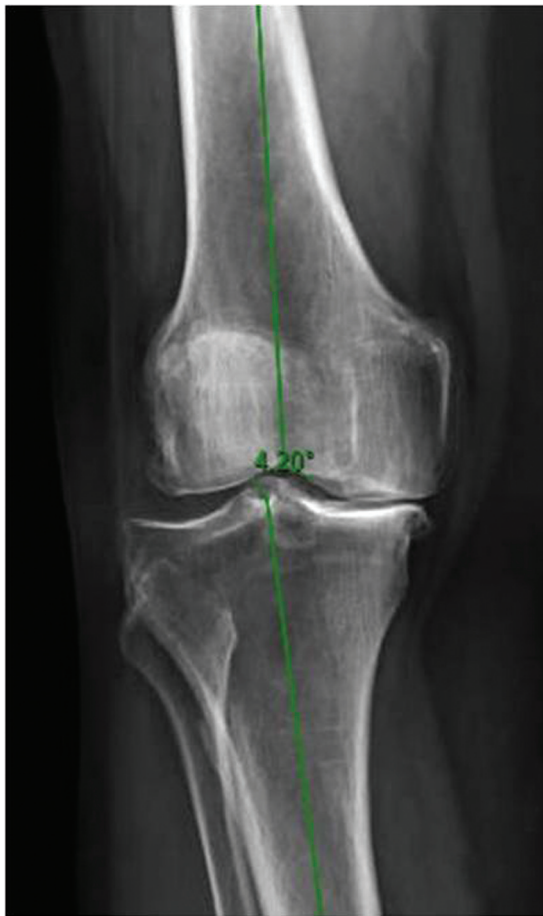
Fig. 2 Preoperative femorotibial mechanical axis on short radiography.