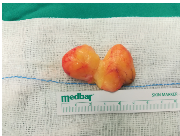
Fig. 4 Excised lipoma. It had to be dissected into two parts, to avoid damaging the motor branch of the median nerve. The two pieces are approximated in this photo.

Several cases of median nerve compression have been reported in the literature, mimicking a carpal tunnel syndrome, 1,2,5,6 but very few cases are reported having a compromised thumb motion due to compression of the median nerve's motor branch. 9 Our case involved dysfunction of the thenar muscles, confirmed by EMG studies, in addition to fingers' tingling due to median nerve neuropathy, which was caused by compression of the lipoma. Most lipomas are superficial, and they might compress palmar structures from above, whereas deep lipomas can blend with nerves or tendons in various ways. One can find them passing either above 10 or even through the tumor. 9 Our case represents a very rare image of the recurrent motor branch of the