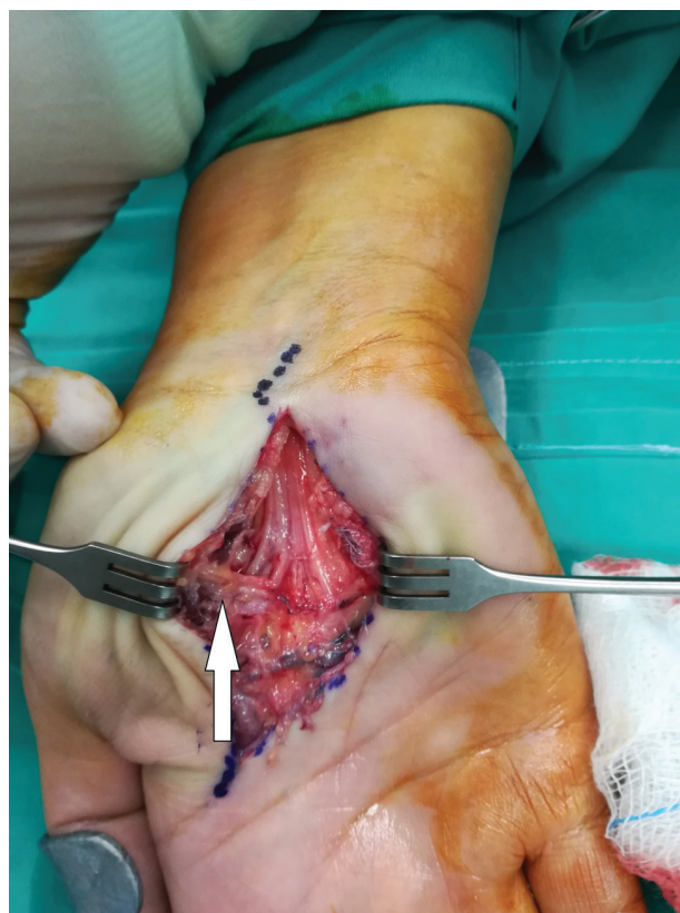
Fig. 5 View of the palm after lipoma excision. White arrow is pointing at the recurrent motor branch of the median nerve.