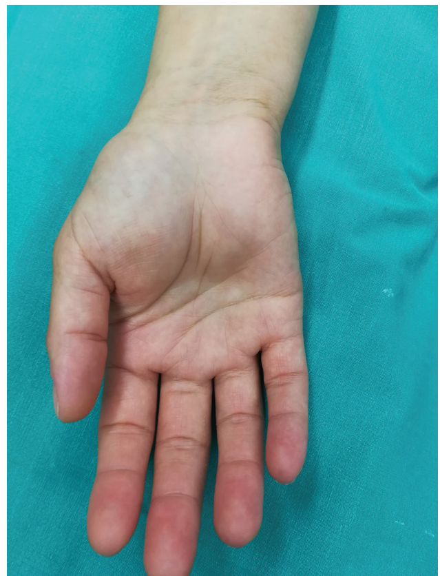
Fig. 1 Clinical Image of the patient's right palm. A soft-tissue mass of the thenar and hypothenar area is visible.

It is widely accepted that tumors larger than 5 cm are considered giant lipomas, 1,2,4 and they present a higher possibility of malignancy. 7 Hand lipomas can be either superficial or deep. Deep lipomas are categorized as