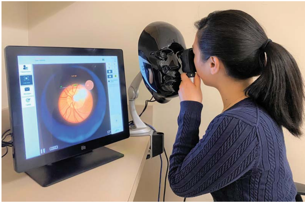
Fig. 1 Student using the Eyesi Direct Ophthalmoscope Simulator to examine a virtual patient. Computer monitor displays student's view of the fundus in virtual reality.

the traditional small group curriculum during their first 2 years and later the Eyesi Direct Ophthalmoscope Simulator during an ophthalmology clinical elective. Only students who had completed all four Eyesi training modules were included. Invitations to participate in the survey were sent to the students' IUSM e-mail addresses, and participation in the survey was voluntary and anonymous. The IUSM's Institutional Review Board and committees on human subjects granted exempt status for this study.