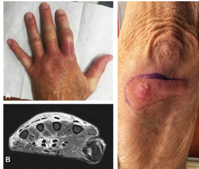
Fig. 2 M. chelonae musculo-cutaneous infection in a solid-organ transplant. Left hand swelling and cellulitis (A) are noted with corresponding flexor tenosynovitis and associated lumbrical myositis of the third to fifth digits seen on gadolinium-enhanced magnetic resonant scan (B). The infection progressed to the ipsilateral elbow with nodule and abscess formation (C).

a specific bacterial strain. In vitro studies and clinical reports show promise in SOT recipients, patients with ventricular assist devices, and nontransplant candidates. 84 To date, there have been four reported cases of their use in treating infections with MDR organisms in lung transplant recipients. 85,86 One of these patients was a 15-year-old girl with CF and disseminated M. abscessus infection. After receiving over 8 years of antimycobacterials, she received a bilateral lung transplant. Following transplant, her antimicrobials were stopped due to side effects and she developed worsening pulmonary and surgical site infections. She was treated with a prolonged course of intravenous and topical bacteriophage-containing solutions in combination with resuming her antimicrobials and she experienced clinical and bacteriologic improvement over the subsequent 6 months. 86,87 Although further research for its use in mycobacterial infections before and after transplant is needed, bacteriophage therapy seems to be a potential option for challenging NTM infections and reducing cumulative antimicrobial exposure.