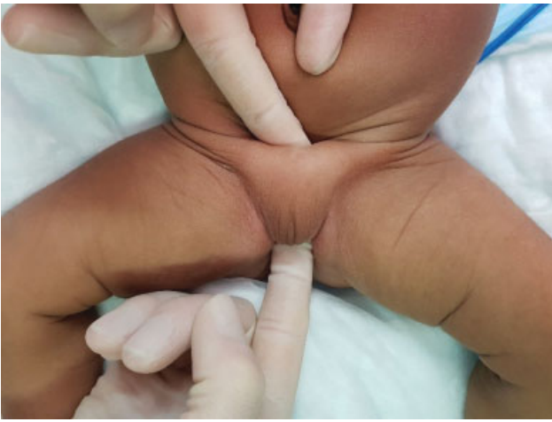
Fig. 1 Demonstration of thickened pubic symphysis.

Ultrasound was not able to confirm whether the balloon of the catheter was indeed within the bladder or within the vagina. As a result, the decision was made to take the child for an examination under anesthesia and perineal stimulation. The anal opening was confirmed to be significantly anterior to the sphincter complex. A laparotomy was therefore performed to fashion an end colostomy and drain the hydrocolpos. At laparotomy, a normal uterus and fallopian tubes were identified and the vagina appeared thickened and hypertrophic without significant fluid content. A formal vaginostomy was therefore not a feasible option as the vagina was not dilated enough to reach the abdominal wall. Hence, a