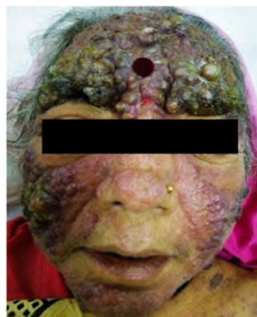
Fig. 1 Multiple nodular skin lesions over the face.

Based on the above investigations, she was diagnosed as a case of CML in blast crisis with leukemia cutis as an extramedullary deposit. CML in blast crisis has a dismal prognosis with a median survival of 9.4 months. Our patient finally succumbed to death after 4 months of presentation. This case emphasizes the fact that a high degree of suspicion and expertise is important for diagnosing such uncommon presentation of common malignancies. Hence, early diagnosis of such rarer presentations helps in appropriate treatment, which ultimately leads to better chance of survival and reduces the risk of fatality.