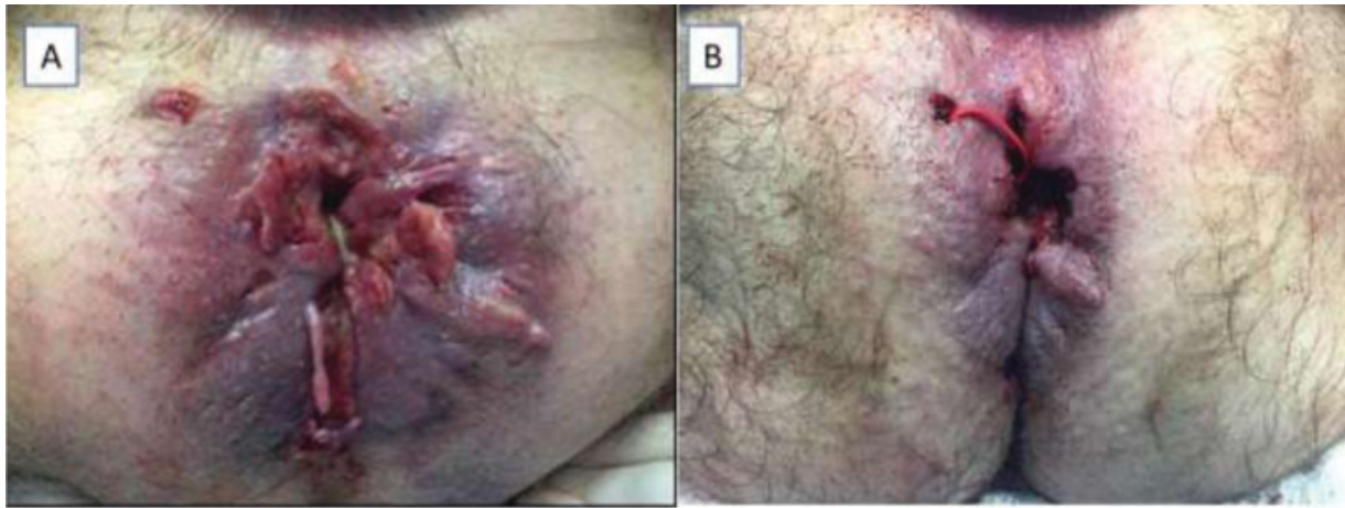
Fig. 2 (A) Perianal Crohn's disease with complex fistula, ulcerations and skin tags; (B) Seton placement in complex anal fistula after anorectal EUA.