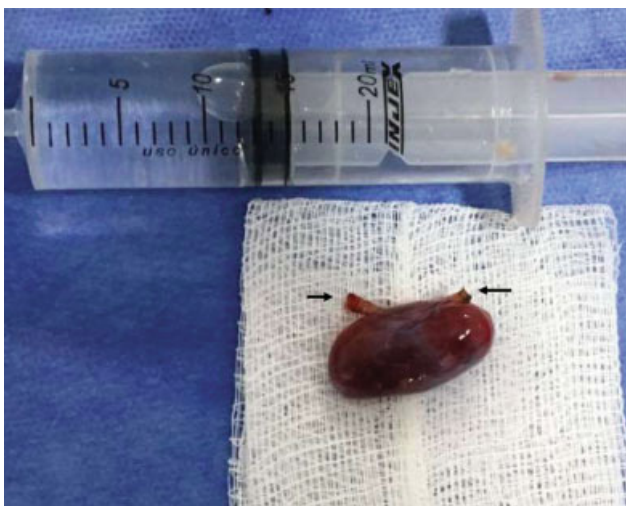
Fig. 3 Macroscopic aspect of completely excised paraganglioma. The two black arrows evidence, respectively, the proximal and distal remains of the filum terminale.

An anatomopathological macroscopic examination showed a well-defined encapsulated red lesion measuring 3.0 \times 1.5 \times 1.5 cm, with a grayish smooth surface, elastic consistency, and small cystic cavities observed after slicing. The microscopic examination was suggestive of myxopapillary ependymoma under hematoxylin and eosin. However,