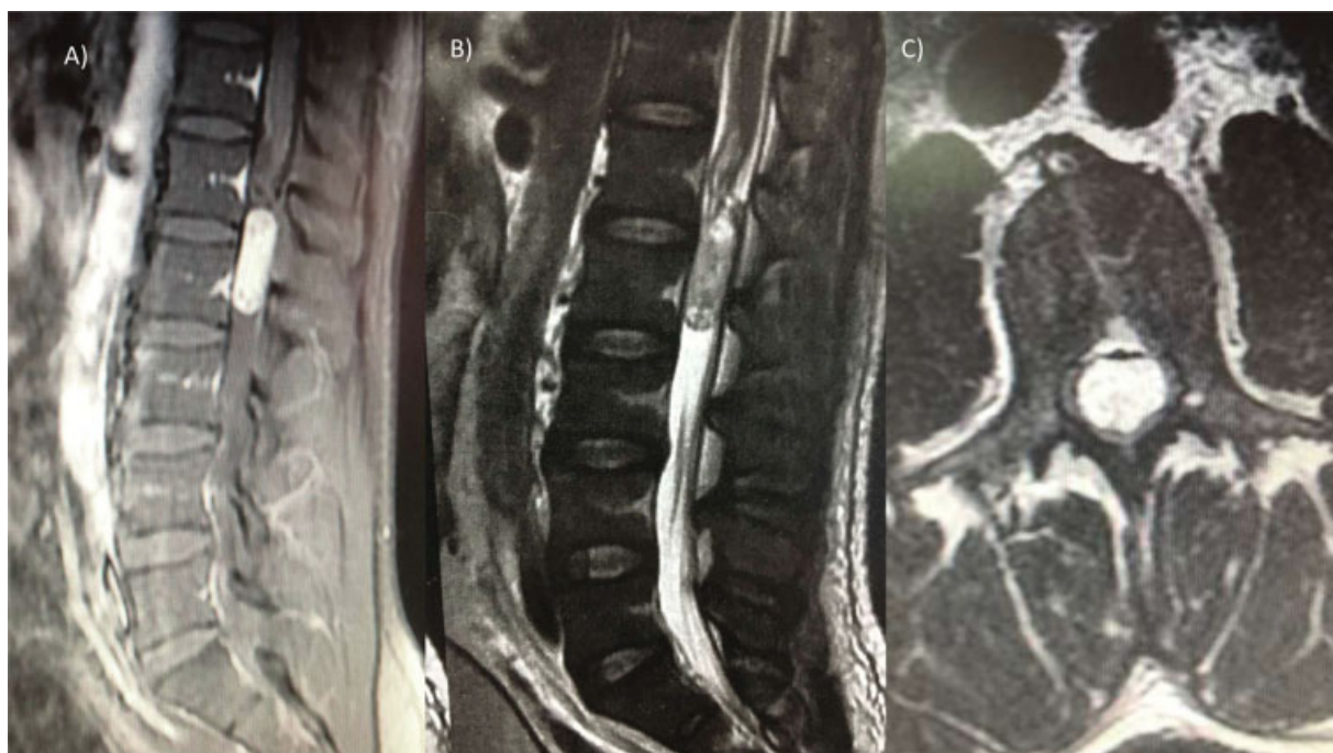
Fig. 1 Magnetic resonance imaging of the lumbar spine showing an intradural mass at L2. (A) T1 weighted with contrast sagittal view. (B) T2 weighted without contrast sagittal view. (C) T1 weighted with contrast axial view.

A 36-year-old male was admitted at the hospital with complaints of bilateral low back pain of 4 months of evolution associated with progressive paraparesis – muscle strength grade 4 on the lower limbs, proximal and distal. The patient also had urinary and fecal retention that were progressively worsening. An MRI of the lumbar spine was performed and evidenced an intradural expansive lesion at the level of the L2 vertebrae with an estimated dimension of 3.0 × 2.0 cm (► Fig. 1).