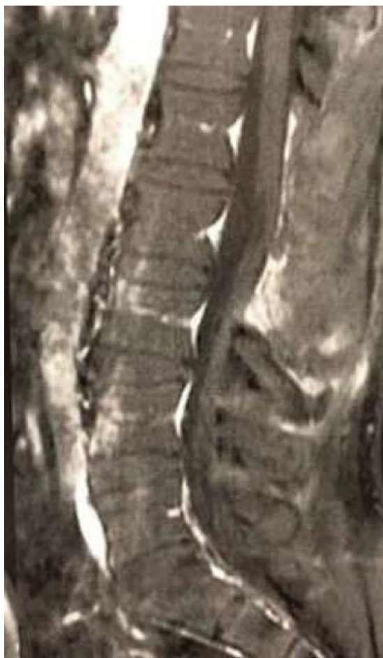
Fig. 5 Two-year postoperative magnetic resonance imaging with no evidence of recurrence.

states in spinal paragangliomas may have two reasons: first, the incapacity of the tumor cells to secrete stored substances, or second, the incapacity of these substances to cause a clinical syndrome. 7