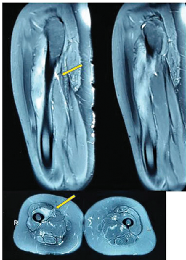
Fig. 1 Metastatic lesion in vastus intermedius (yellow arrow).

adenocarcinomas, whereas squamous cell carcinomas have a tendency to locally invade the thoracic wall. 1 Major sites of metastasis are brain, bone, liver, and adrenals. Hematogenous metastasis to skeletal muscle is very rare, even in autopsy studies. Out of 500 autopsies conducted by Willis in carcinoma patients, only four were found to have skeletal muscle metastasis. 2 Even the cancers, which commonly metastasize to the bone such as prostate, breast, and thyroid cancers, only rarely disseminate to soft tissues. 3 According to one of the hypotheses, muscle contractions may prevent metastasis by inducing a high tissue pressure and variable local blood flow, thereby discouraging implantation of tumor cells. 4 According to prior wittich in 1854 provided the first description of a muscle metastasis and Willis was the first to report a muscle metastasis of lung origin. 5 In their case series, Koike et al reported seven cases of carcinoma presenting with skeletal muscle metastases. Four of them were found to have pulmonary origin, of which two were adenocarcinomas and two squamous cell carcinomas. 6