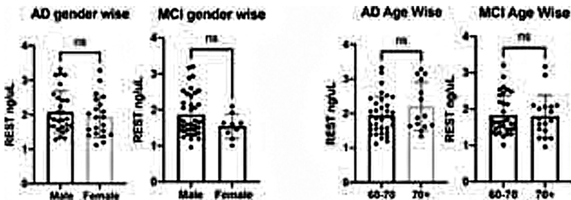
Fig. 3 Level of serum RE-1-silencing transcription factor (REST) in Alzheimer’s disease (AD) and mild cognitive impairment (MCI) in age and gender wise.

Abbreviations: AD, Alzheimer’s disease; MCI, mild cognitive impairment; REST, RE-1-silencing transcription factor.