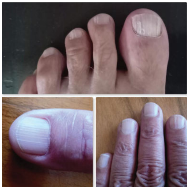
Fig. 3 Images demonstrating longitudinal ridging and splitting of the toenails and fingernails.

Recently, AXIN2 mutations have been associated with colorectal polyposis and oligodontia. 8,11,12,18,19 Lammi et al. 12 (2004) identified an AXIN2 mutation in a four-generation Finnish family, in which eleven members presented oligodontia, and eight had CRC or precancerous lesions of variable types. Marvin et al. 18 (2011) described a family with an inherited AXIN2 mutation (c.1989G > A) presenting an autosomal dominant pattern with manifestations of oligodontia and other findings, such as gastrointestinal polyps, a mild ectodermal dysplasia phenotype with sparse hair and eyebrows, and early onset CRC and breast cancers. In 2014, Rivera et al. 11 found an AXIN2 germline variant (c.1387C > T) in one family with attenuated FAP. Carriers of this variant exhibited a variable number of polyps, but had no signs of ectodermal dysplasia. Ectodermal dysplasia includes a large and heterogeneous group of hereditary diseases characterized by clinical manifestations related to alterations in ectodermal structures, such as hair, nails, teeth, and skin. In the present case, the patient had hypodontia, sparse body hair without involvement of the scalp and eyebrows, and onychodystrophy.