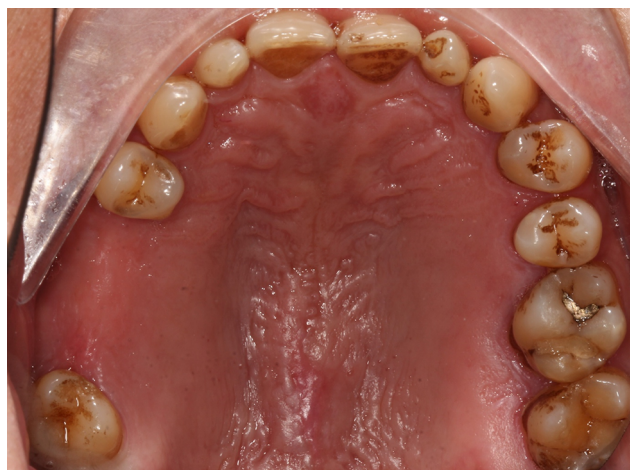
Fig. 2 Healing after 14 days postexcisional biopsy and trectomy.