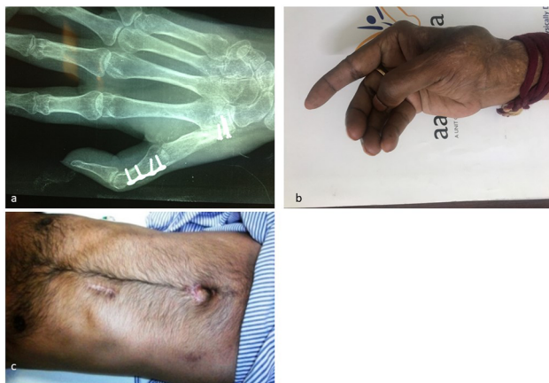
Fig. 3 (A) X-ray 9 months after bone grafting right thumb. (B) Right thumb movement after 7 years. (C) Inconspicuous upper abdominal scar after 2 years.