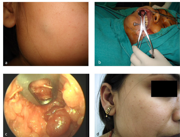
Fig. 1 (A) Preop vascular malformation right cheek. (B) Intraoral approach to vascular malformation. (C) Endoscopic view of vascular malformation. (D) Postop vascular malformation right cheek.

Excision of vascular malformation of cheek—A 27-year-old, unmarried lady presented with a bluish swelling of her right cheek (► Fig. 1A ). Based on the clinical signs of compressibility, blanching on pressure and surface color Doppler findings,