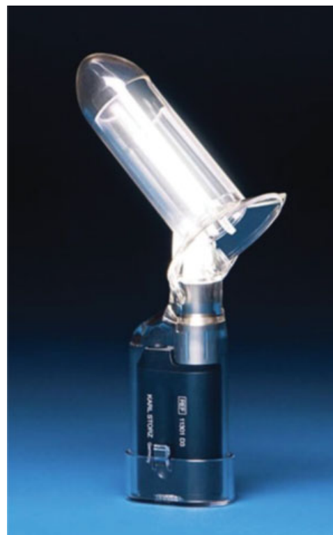
Fig. 1 EndoPex AC002 Anoscope.