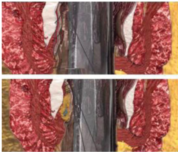
Fig. 6 3-4 passed from 1 to 1.5 cm away, finishing 0.5 cm from the pectineline.

was a need for resection (one or more) of intolerated plicomas.