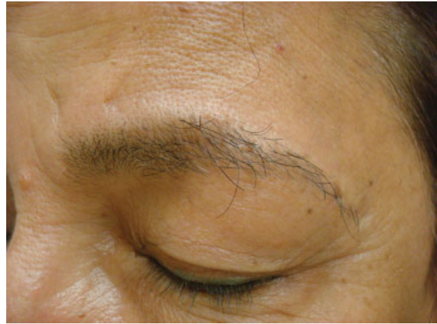
Fig. 7 Eyebrow poor density.

but are expected to gradually adapt to the recipient dominance and require trimming less often. 9,15 Hair transplant for eyebrow restoration is time-consuming and laborious, but the results are rewarding.