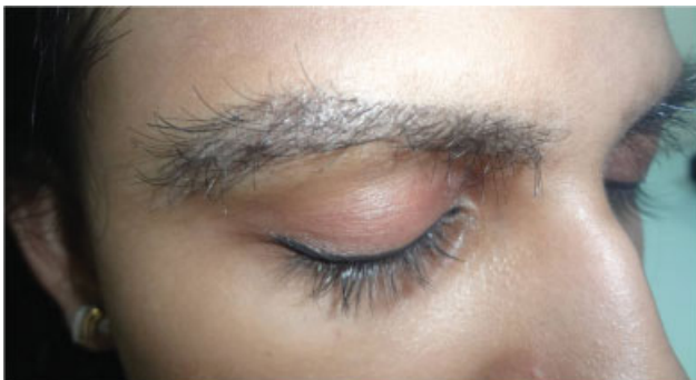
Fig. 5 Misdirection of the grafts.

Swelling, infection, bruising, folliculitis, and sebaceous cysts are extremely rare events in hair transplant for eyebrow reconstruction. 8-11,15 Complications are mainly related to the curling of the hair, misdirection (► Fig. 5), growth away from the skin like a canopy (► Fig. 6), poor density (► Fig. 7), poor growth and failure of growth of the grafts. Wavy, curled or distorted, misdirected, growth may occur from excessive handling, squeezing of grafts during implantation, poor circulation from scarred bed, and compression from the surrounding scar tissue. 8-11,15 Aligning the hair down along the orbital margin, with vaseline or coconut oil, on the fingertips may help to regulate the direction. 9,15 Sometimes, waiting for few months allows the hair to grow longer and often improves the direction of the transplanted hair. Patients are always counseled for a second sitting for density. The hair growth from grafts implanted in scarring alopecia and postburn and posttraumatic scar areas is often delayed. In our review of 63 cases of eyebrow restoration, 15 and addition of a few more cases since the last report, 15 it was concluded that 14% patients of eyebrow restoration could be corrected in one sitting, 77% required two sittings, and 9% required three sittings. Scalp hair grafts grow faster initially