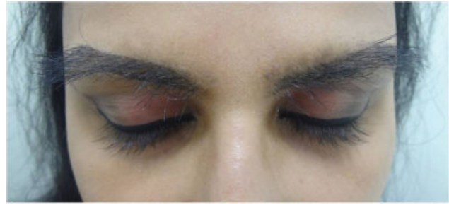
Fig. 6 Outward growth of grafts like a canopy.