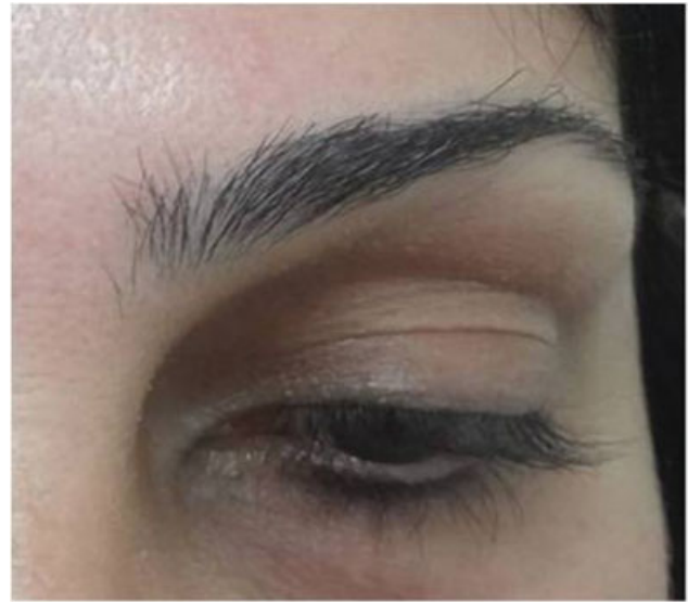
Fig. 1 Natural layout and eyebrow pattern.

Pattern and shape of the opposite brow or old photograph can serve as a guide. An eyebrow slanting downward gives an elderly look, and eyebrow arched higher gives a surprised look. An eyebrow placed low medially and raised laterally gives an angry look. Lateral end should be at the same