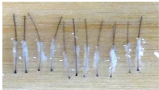
Fig. 4 Single hair grafts for eyebrow restoration.

The other technique rarely used is follicular unit transplant (FUT). In FUT, a horizontal, elliptical strip of scalp 1 cm × 4 to 5 cm, below the occipital protuberance, is excised and the wound closed in two layers, leaving a thin cosmetic scar. Such