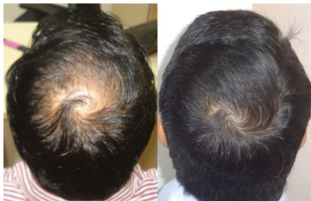
Fig. 11 Results of using topical minoxidil and oral finasteride.

in the transplanted and surrounding areas. Improvement of these hairs not only stabilizes hair loss progression but also augments hair transplant outcomes. This approach goes a long way in optimizing donor supply over patient's lifetime and increasing the interval between two transplants. 9,10,60,61 When planning a transplant, it is important to put these considerations across to the patient and emphasize the benefits of a holistic approach (→Fig. 12).