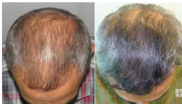
Fig. 10 Results of using topical minoxidil and oral finasteride.