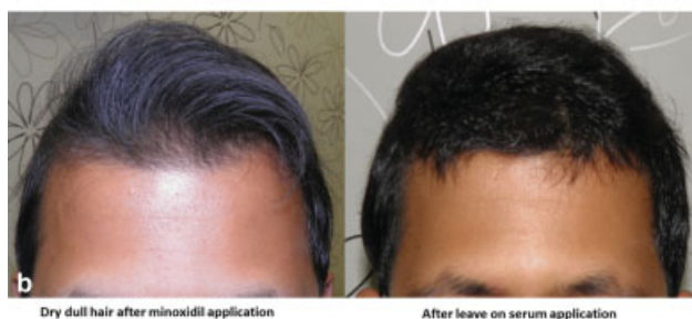
Fig. 8 (a) Dull look after minoxidil application. (b) Addressing dull look after minoxidil application with leave on serum.