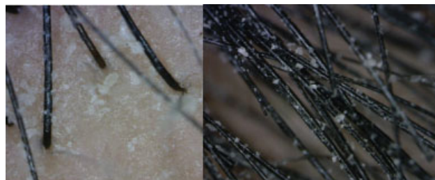
Fig. 7 Minoxidil crystal precipitation on hair