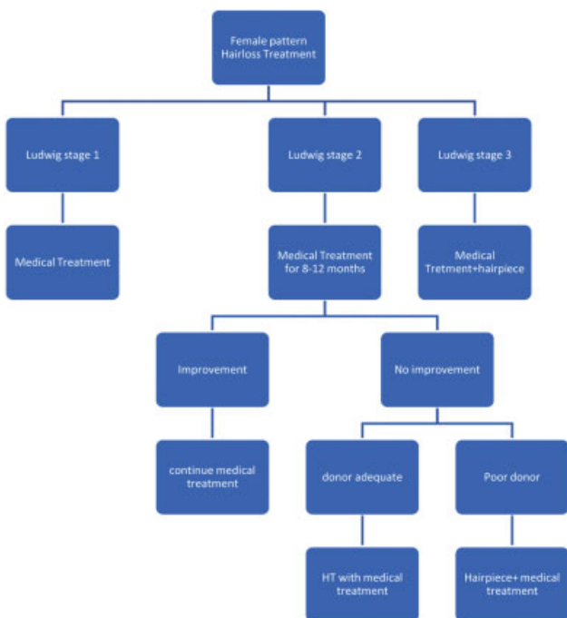
Fig. 3 Algorithm for treatment of female pattern hairloss.

Various treatment modalities can be combined to give better outcomes. The only clinically proven combination is minoxidil with finasteride. 16,17