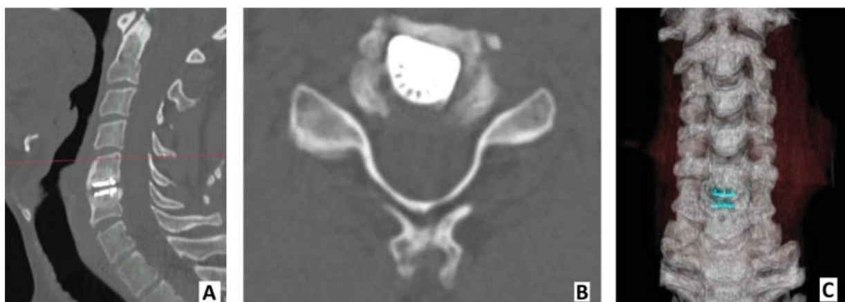
Fig. 2 Computed tomography (CT) scans of grade-III HO (previous clinical case): (A) sagittal CT scan; (B) axial CT scan; (C) three-dimensional CT scan.