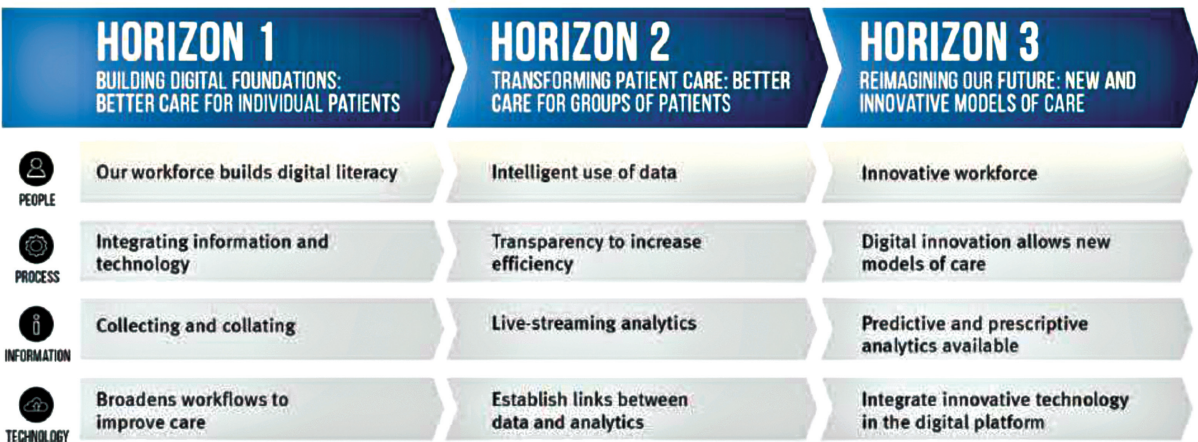
Fig. 1 Digital clinical strategic framework to assist with articulation of clinical requirements for digital transformation. 26,27

requiring the use of an alternate platform for telehealth. Specifically in Metro North, the use of Microsoft Teams required a significant shift in access requirements. Due to consumer and clinician demand, this change will likely be difficult to reverse, highlighting the need for updated ethical guidelines regarding the use of telehealth in both hospitals and primary care. 36