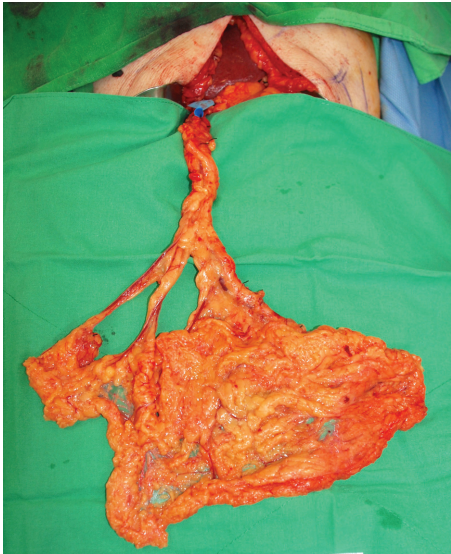
Fig. 3 Intraoperative picture of the right gastroepiploic-vascularized lymph node transfer (GE-VLNT).

branches allowed further release of the flap from the stomach and permitted complete visualization of the gastroepiploic vessels (► Fig. 3). Dissection continued to the level of the right epiploic vessels. The lymph nodes within the flap cannot always be visualized, but they often can be palpated. Indocyanine green lymphatic imaging may be performed to confirm the vascularity of the lymph nodes included within the flap. 3,7,9 In one patient, the gastroepiploic-VLNT required coverage with a STSG, while rotational skin flaps were sufficient to cover the other patient's flap.