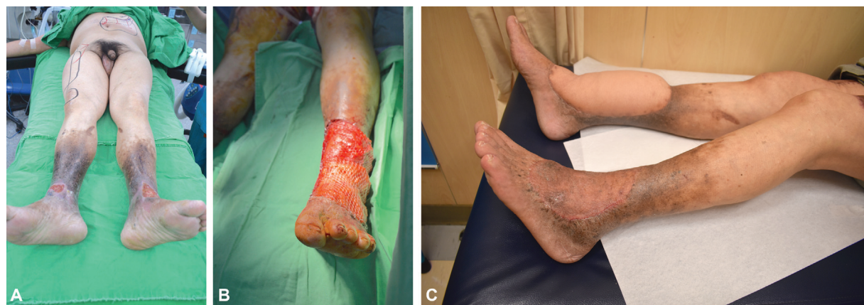
Fig. 1 Posttraumatic lymphedema managed with a gastroepiploic-vascularized lymph node transfer (GE-VLNT). (A) 50 year-old male undergoing simultaneous ALT and GE-VLNT; (B) Flap inset of the left lower limb; (C) Postoperative picture of the lower limbs at 1 year of follow-up. ALT, anterolateral thigh; GE-VLNT, gastroepiploic-vascularized lymph node transfer.

The right gastroepiploic artery and vein were used for GE-VLNT (►Fig. 2). The flap was harvested through an upper midline laparotomy incision. The omentum was carefully dissected out of the transverse colon, avoiding injuries to the mesocolon. The left gastroepiploic vessels were then ligated and divided. Dissection of the short segmental gastric