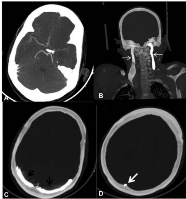
Fig. 1 (A) Axial computed tomography (CT) angiography source images show normal opacification of circle of Willis in arterial phase. (B) Coronal CT images with wide window setting show opacification of bilateral jugular veins (white thin arrows) due to reflux. (C) Axial CT image with wide window setting shows reflux into bilateral transverse sinuses (black arrows). (D) Axial CT image with wide window setting shows reflux into posterior part of superior sagittal sinus.

that the reflux of contrast into neck veins is more common if left arm injection is used. Both the studies conclude that a developmentally decreased retrosternal distance on left side is the cause of this phenomenon as the left brachiocephalic vein is more transverse in course, and delivers a higher amount of undiluted contrast material obscuring the origins of the great vessels. Also, compression of left brachiocephalic vein by aorta can cause reflux into neck veins. In our case, the cause of reflux was likely due to contrast injection from the left arm. However, presence of underlying venous insufficiency or valvular incompetence may be there.