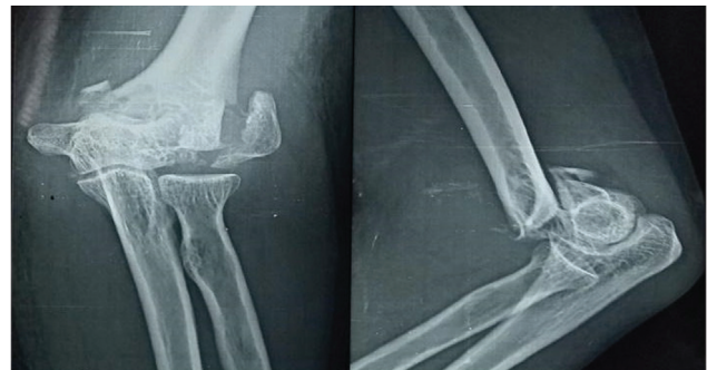
Fig. 1 Case 1: transolecranon approach; preoperative X-ray.

A 15-cm long lazy S-shaped incision was made on the posterior aspect of the elbow, beginning approximately 7.5 cm to 10 cm above the tip of olecranon, superomedially, and ending about 5 cm inferolaterally to dissect ulnar nerve easily and avoid skin necrosis. After dissecting the ulnar nerve, a gap was made between the triceps and the medial intermuscular septum, and the triceps was elevated to the posterior aspect of the humerus. Laterally, the triceps was separated from the lateral intermuscular septum and posterior humerus in conjunction with the anconeus muscle. By