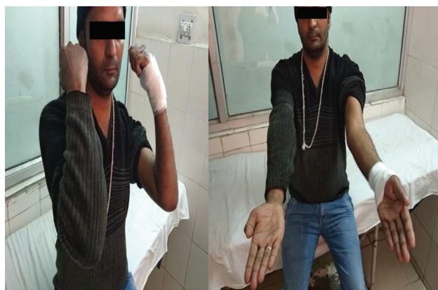
Fig. 7 Case 2: triceps-reflecting approach; range of motion at the last follow-up.