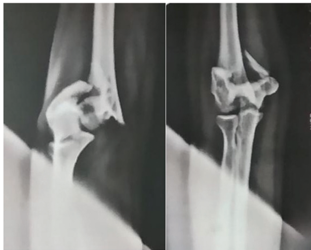
Fig. 5 Case 2: triceps-reflecting approach; preoperative X-ray.

lifting the triceps tendon, the entire distal humerus can be observed, and fixation was performed just as in the olecranon osteotomy procedure (► Figures 5-7 ).