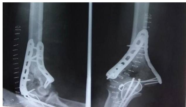
Fig. 2 Case 1: transolecranon approach; postoperative X-ray.