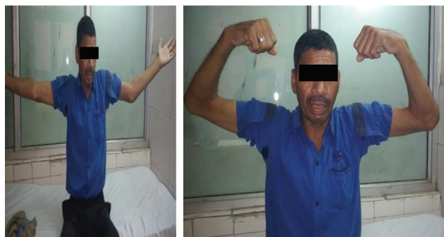
Fig. 4 Case 1: transolecranon approach; range of motion at the last follow-up.